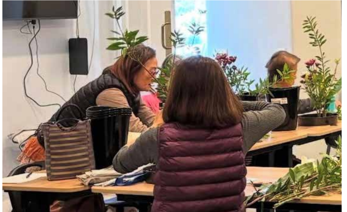
Chinese Floral Arts Foundation USA-Charter will host traditional Chinese Floral arranging in San Marino.