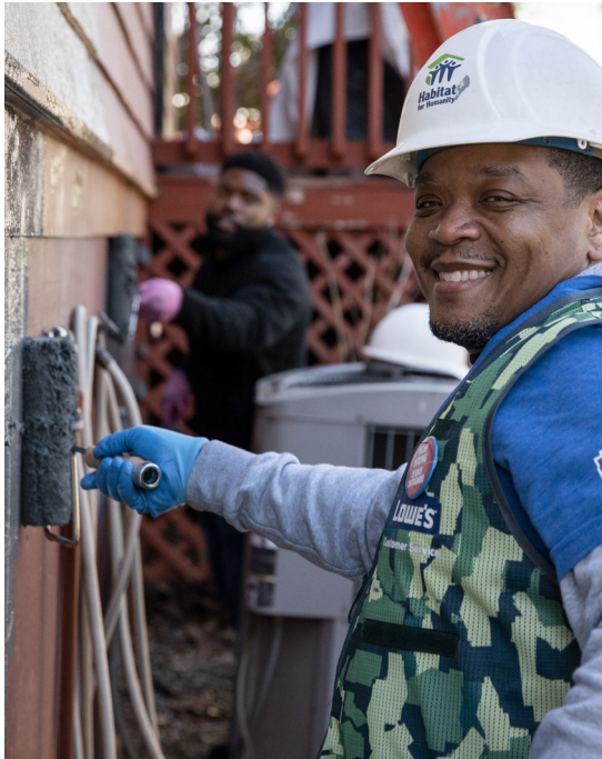
A volunteer helps repair one of many homes in need of tender loving care.

Sharing the vision of a safe and stable place to call home - for everyone.